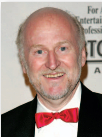
National Endowment of the Arts chairman Rocco Landesman

The emphasis falls on the unusual student, the difficult kid, not on the arts as a subject for study. Landesman doesn't defend arts education as a rigorous discipline that builds concentration and requires practice, practice, practice. Nor does he say, We need arts education to